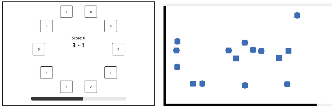
Figure 1. Screenshots of the (translated) stress manipulation: Mental arithmetic task (left) and counting task (right).